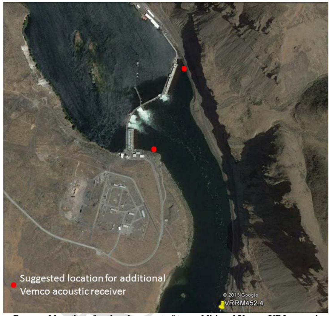
Figure 3 Proposed locations for the placement of two additional Vemco VR2 acoustic receivers in the tailrace of Rock Island Dam.