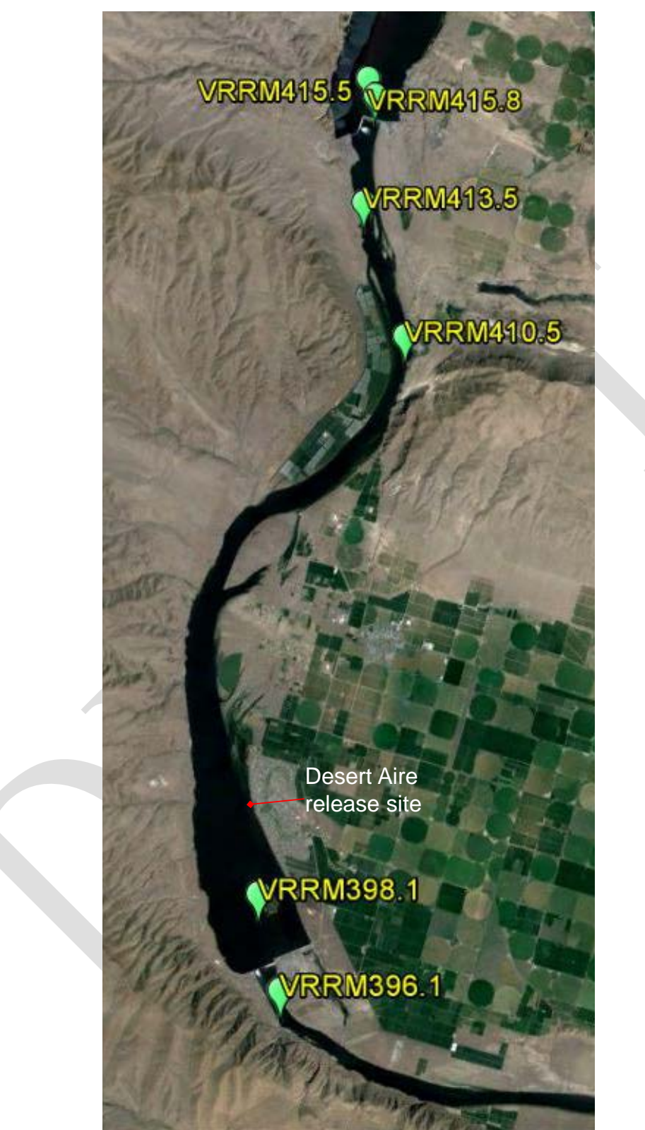
Figure 2 Location of current Vemco VR2 acoustic receivers in Priest Rapids Reservoir deployed for the sturgeon monitoring program. The last four digits of each label (VRRMXXX.X) represent the river mile at the deployed location.