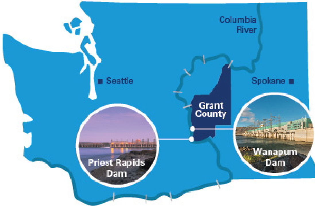
FIGURE 1: PUBLIC UTILITY DISTRICT NO. 2 OF GRANT COUNTY, WASHINGTON