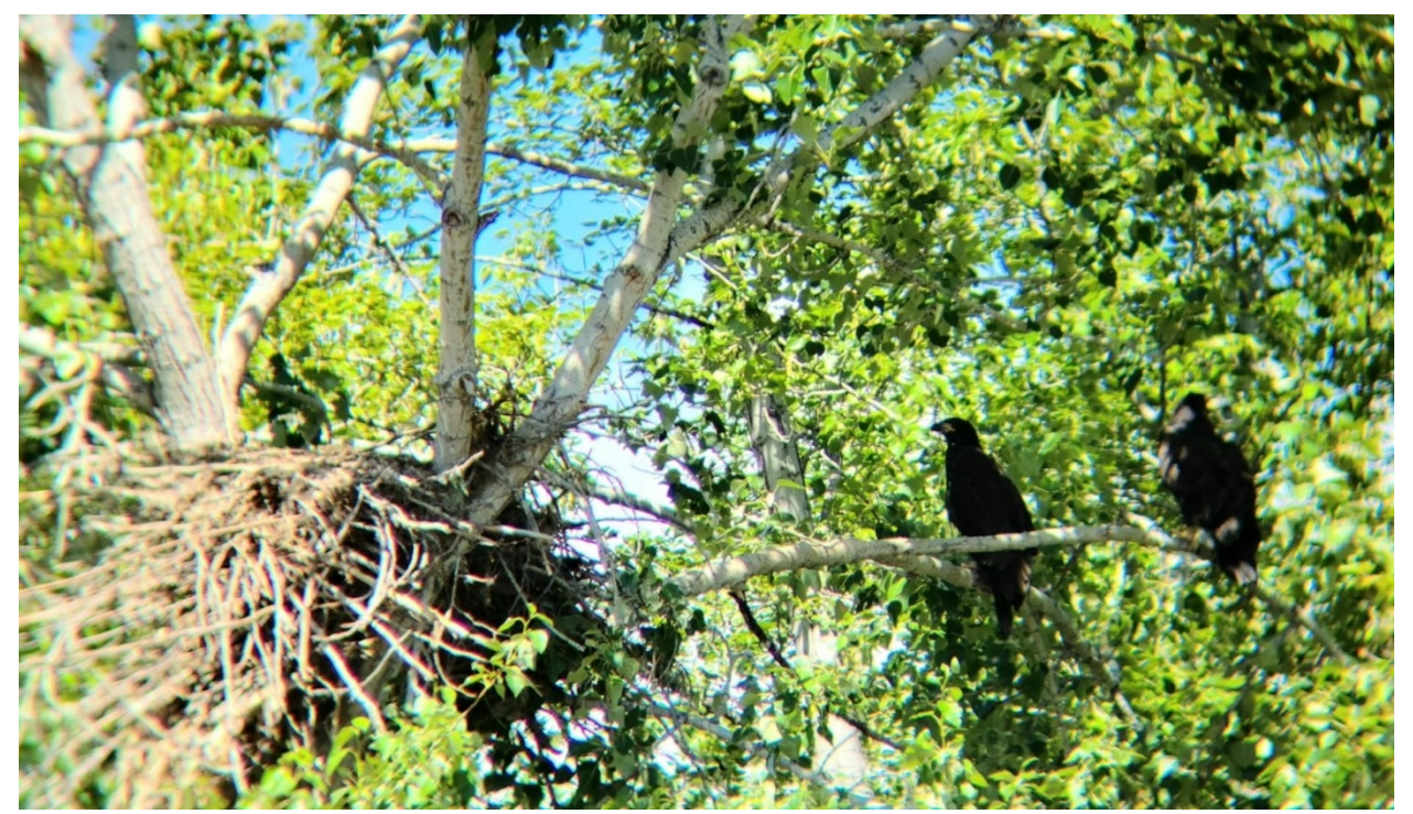
Figure 3 Sentinel Gap eagle twins photographed on July 5, 2022.