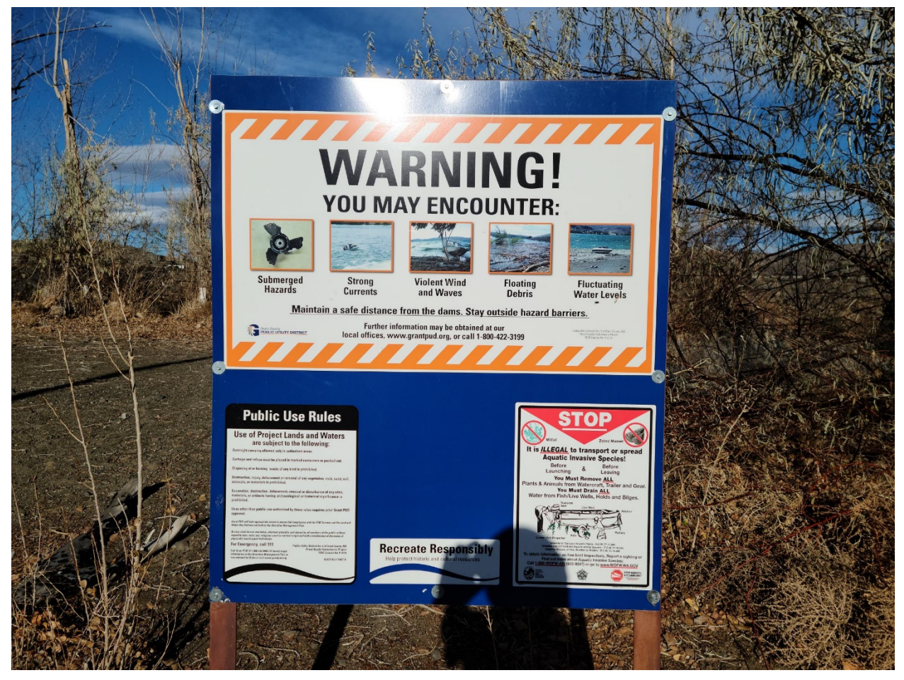
Figure 3 Informational signage at Ellensburg Boat Club boat launch site.

In addition to the website, Grant PUD's Environmental Affairs department has collaboratively developed posters and signage to educate the public on the importance of responsible recreation throughout the Project. There have been numerous conspicuous kiosks and wildlife-specific signage installed and maintained in 2021 at Grant PUD recreation sites and boat launches throughout the Project (Figure 3). In 2022, Grant PUD looks to continue development and installation of additional signs and kiosks within the Project for educational purposes.