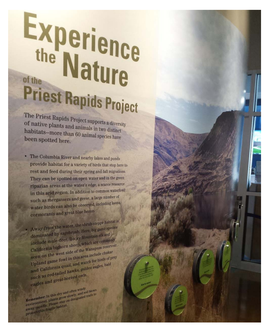
Figure 4 Habitat Information at the Visitor Center.

throughout the exhibit illustrating the importance of maintaining a healthy ecosystem as well as promoting responsible recreation practices (Figure 4). Visitors can also learn where each of the recreation sites are located throughout the Project and what amenities are present (Figure 5). This facility will be opened to the public as soon as the Covid-19 restrictions are lifted.