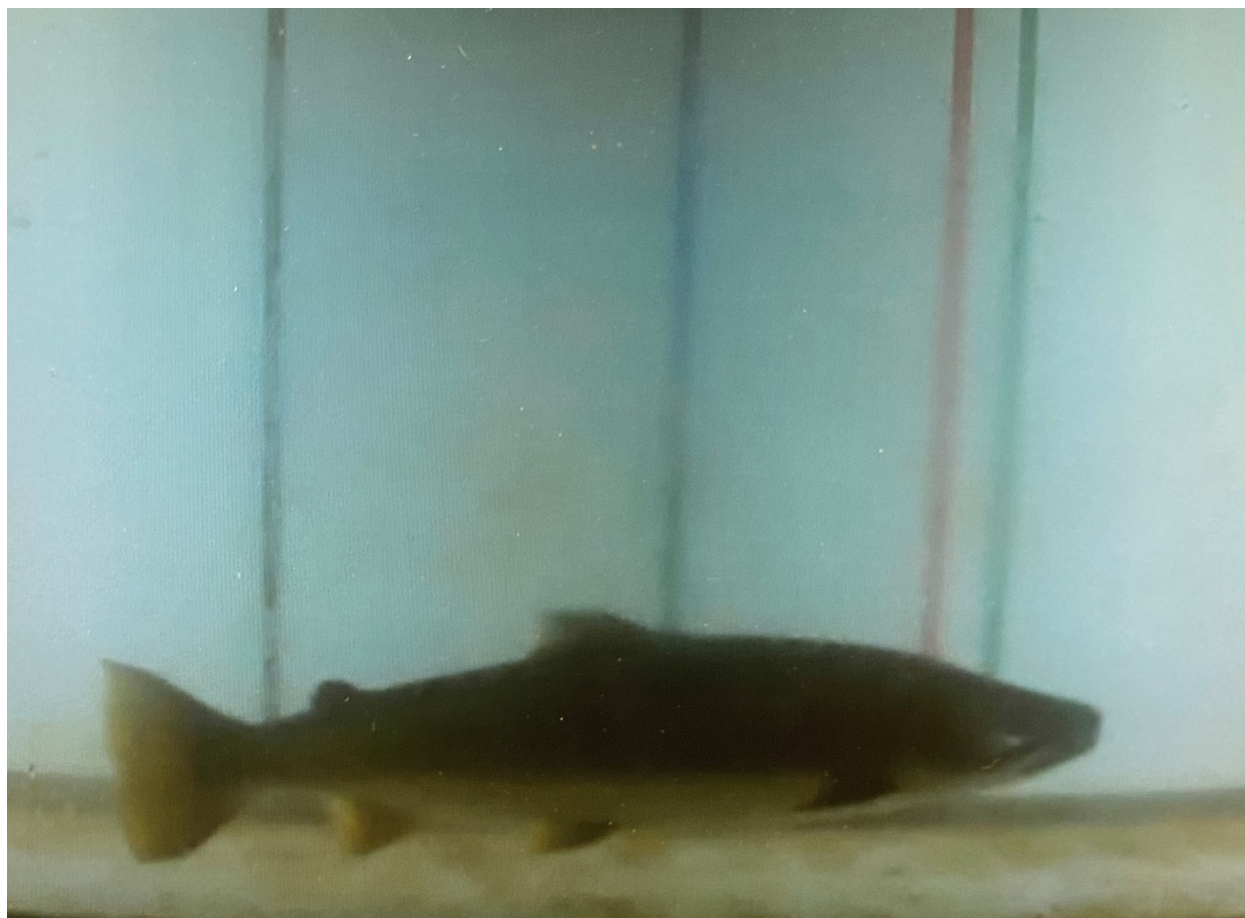
Figure 1 A bull trout with an estimated length of 24 inches passing Wanapum left bank count station on May 21, 2021.

Daily fish passage through Priest Rapids and Wanapum dams can be viewed at the following link: Grant PUD: Fish & Wildlife .